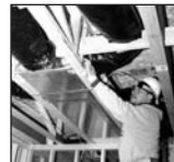
Flexible Insulated Duct