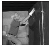
Rectangular Duct Liner