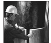
Tank & Equipment Insulation