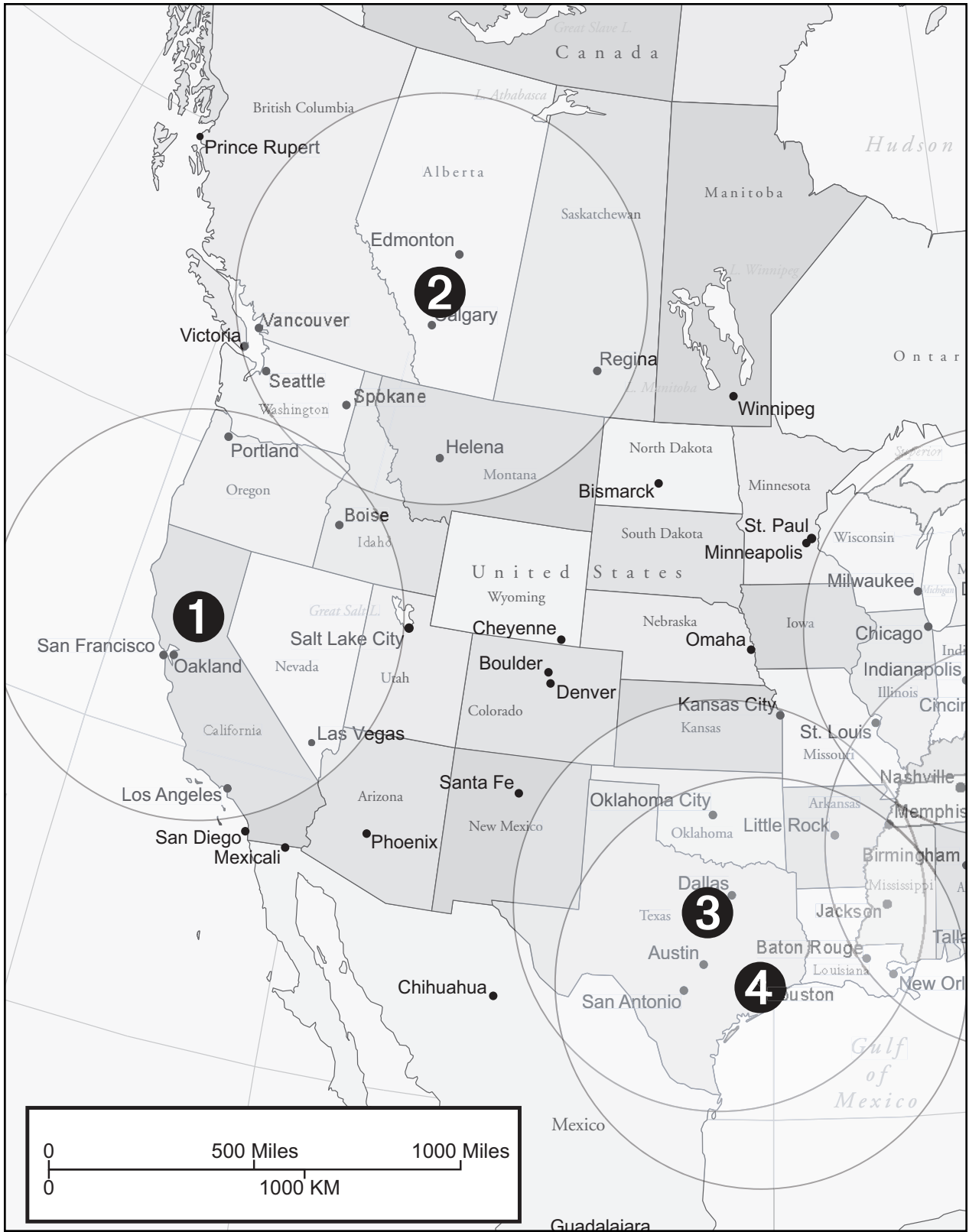
Mechanical Insulation Manufacturing Sites Showing 500 Mile Radii