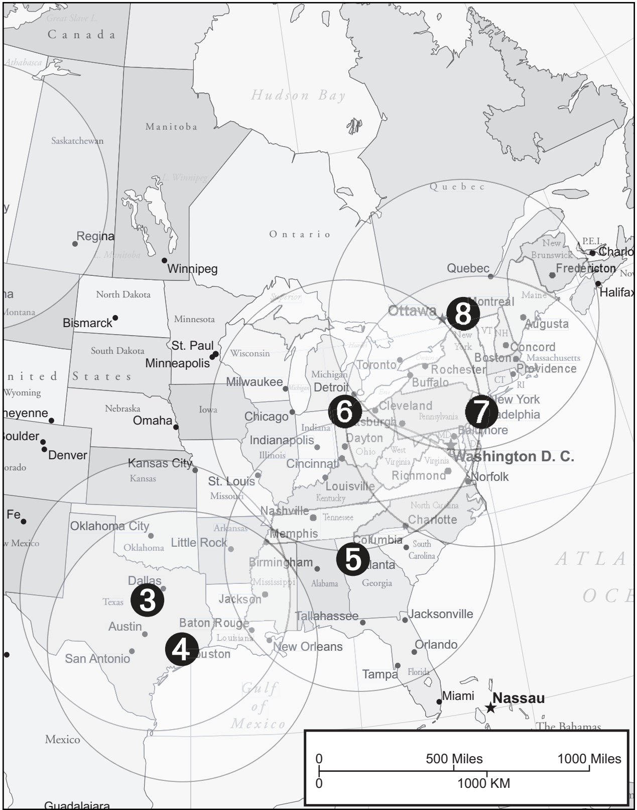
Mechanical Insulation Manufacturing Sites Showing 500 Mile Radii