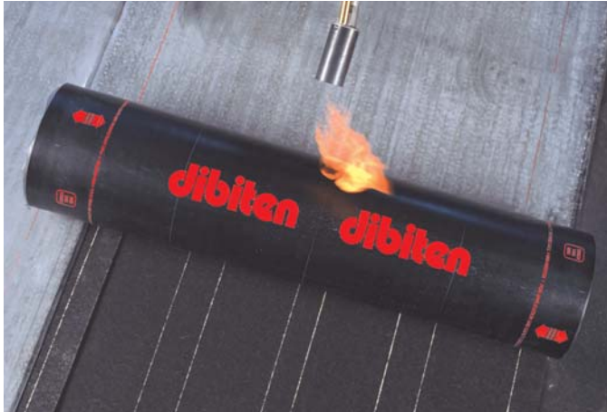
Dibiten Poly/4 APP (Heat Welded)